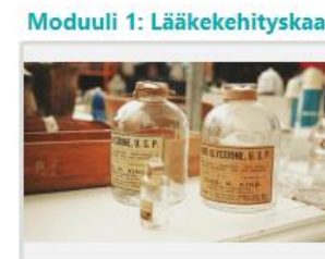
Moduuli 1: Digitaalisuus lää...