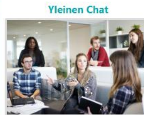
Moduuli 1: Tutkimushoitaja...