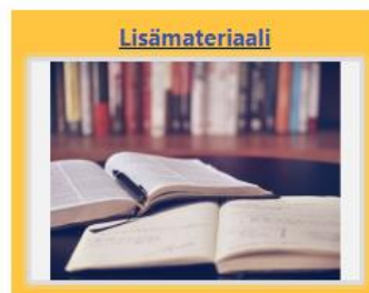
Moduuli 1: Yhteistyö tutkija...